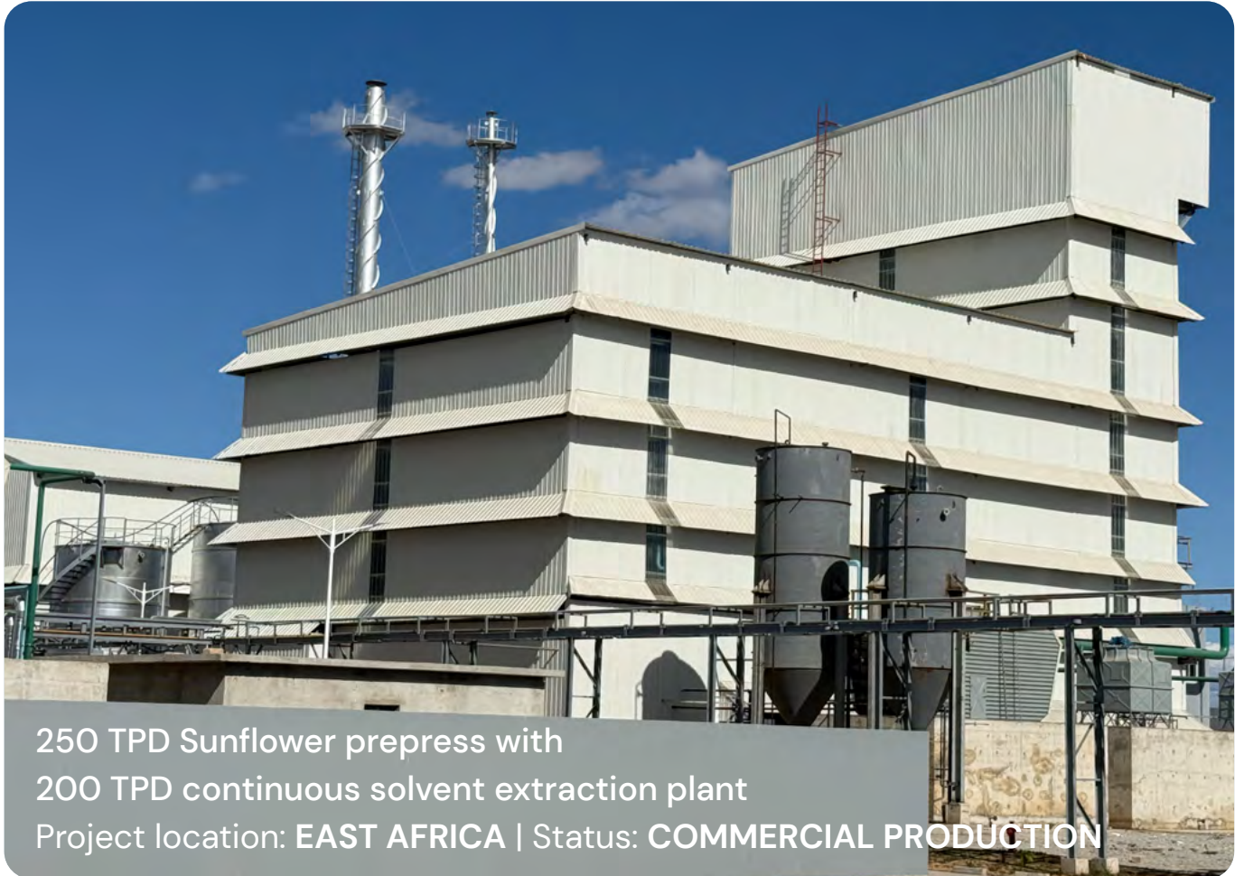
250 TPD Sunflower prepress with 200 TPD continuous solvent extraction plant Project location: EAST AFRICA | Status: COMMERCIAL PRODUCTION