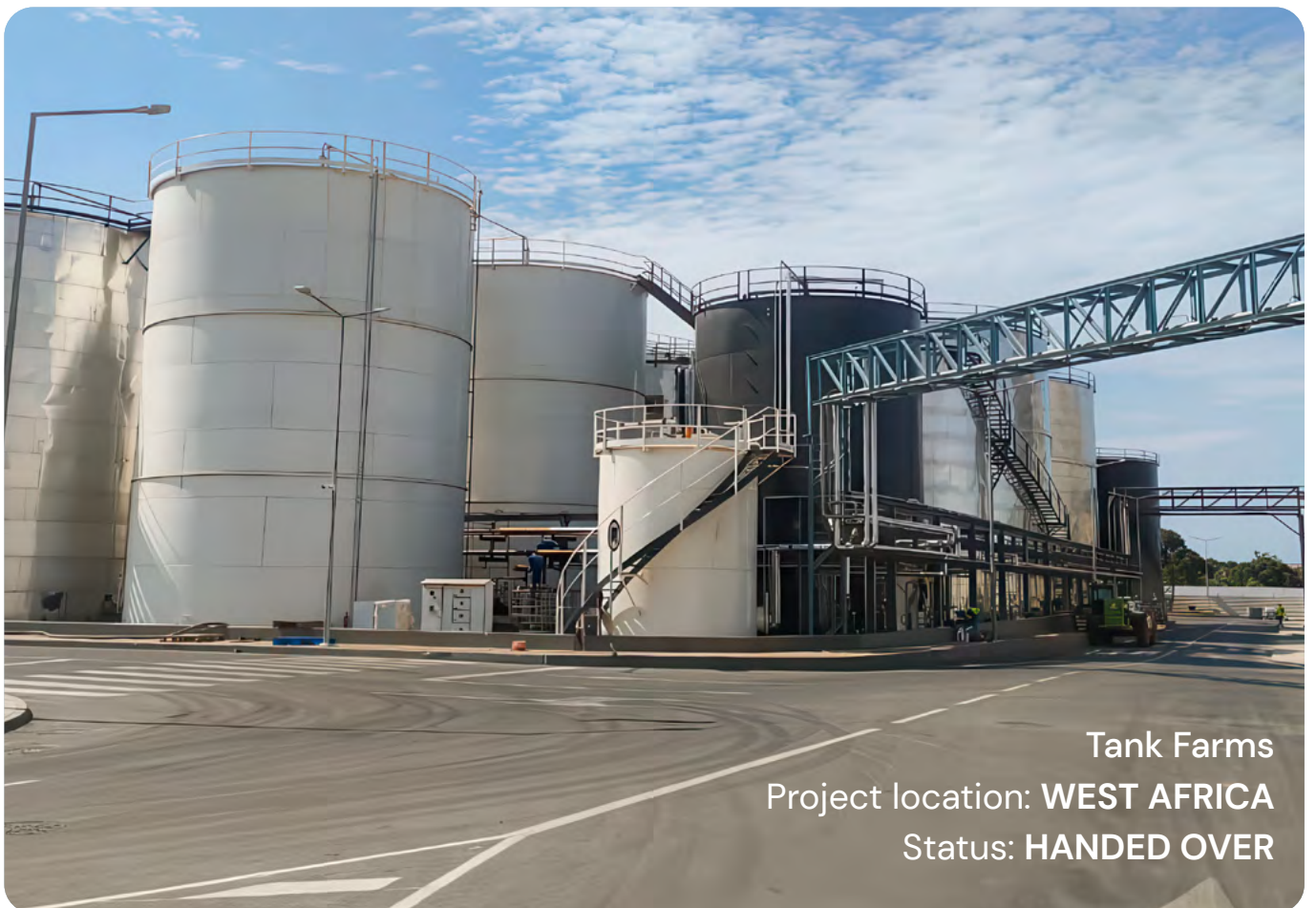
Tank Farms Project location: WEST AFRICA Status: HANDED OVER