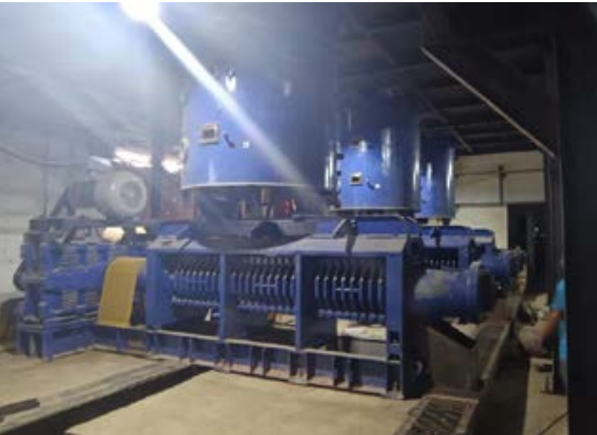
135-150 TPD oil mill for mustard seed in India