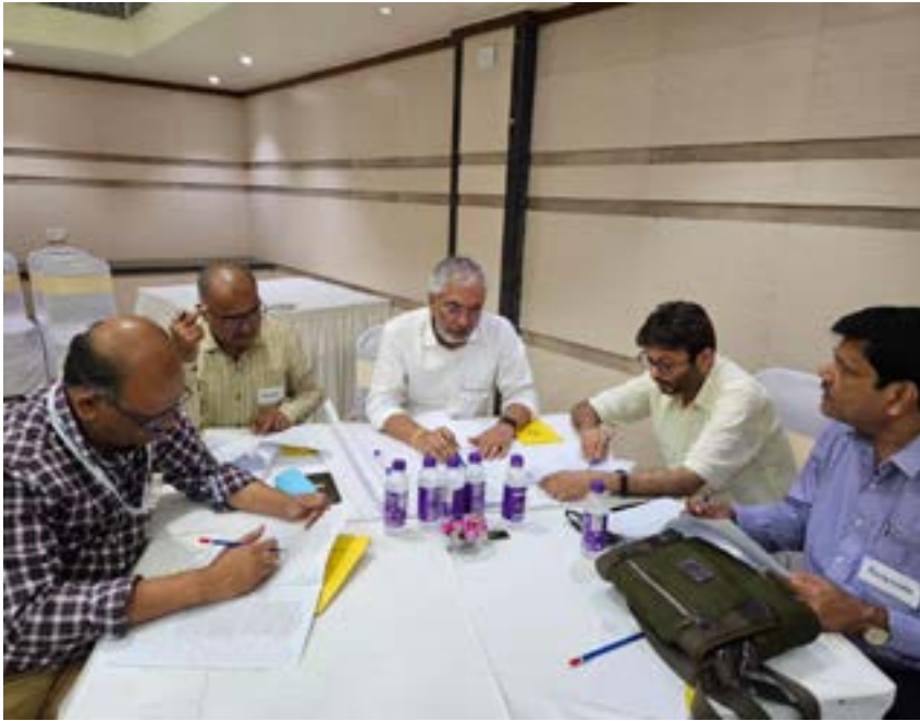
We hosted dual events, elevating leadership and teamwork

Recently, Kumar organised two distinct events aimed at enhancing leadership skills and fostering teamwork within the company. The first session, which catered to top management, department heads, and directors, focused on values, vision, and mission alignment and assessed progress and future goals. The second session involved mid-level managers from various departments, emphasizing their importance in shaping Kumar Metal's future through activities like SWOT analysis and strategic planning.